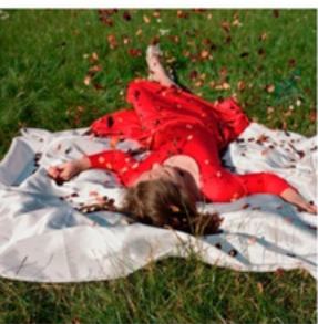
There Is Still Time for Dreaming 2025 ed 3 archival pigment print Fujichrome Provia 120 film 39.5 x 39.5 x 4 cm $650 unframed $800 framed