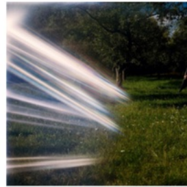
Orchard 2025 ed 3 archival pigment print Fujichrome Provia 120 film 39.5 x 39.5 x 4 cm $650 unframed $800 framed