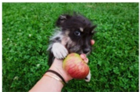
Tafik 2025 ed 3 archival pigment print 59.5 x 39.5 x 4 cm $750 unframed $900 framed