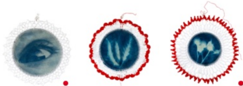
Crocheted pieces 2025 Handmade cyanotype photograms on linen, various sizes $75 - $125