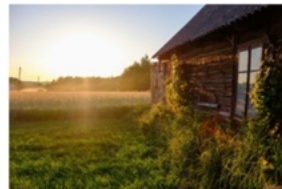
Chata 2015 ed 3 archival pigment print 59.5 x 39.5 x 4 cm $750 unframed $900 framed