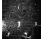
Stodoła 2011 ed 3 archival pigment print 39.5 x 39.5 x 4 cm $650 unframed $800 framed