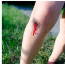
My Bloody Kneephew 2025 ed 3 archival pigment print 39.5 x 39.5 x 4 cm $650 unframed $800 framed