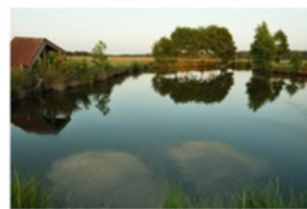
Jeziórko 2025 ed 3 archival pigment print 59.5 x 39.5 x 4 cm $750 unframed $900 framed