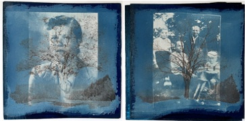
Family Tree 2025 diptych hand printed cyanotype photogram on found vintage canvas 50 x 100 cm $1500