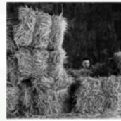
Hide and Seek I 2025 ed 3 archival pigment print 39.5 x 39.5 x 4 cm $650 unframed $800 framed