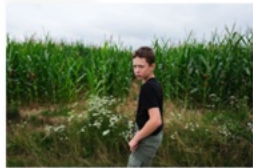
Olek 2025 ed 3 archival pigment print 59.5 x 39.5 x 4 cm $750 unframed $900 framed