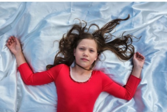
Karolina II 2025 ed 3 archival pigment print 59.5 x 39.5 x 4 cm $750 unframed $900 framed