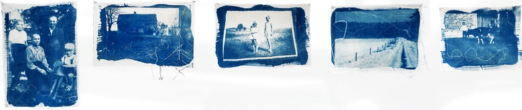
Mini Concertina Artist Book 2025 ed 3 + 1 AP 36 two-sided, unique, coated with cold wax UV varnish 11cm x 156cm 140gsm $195